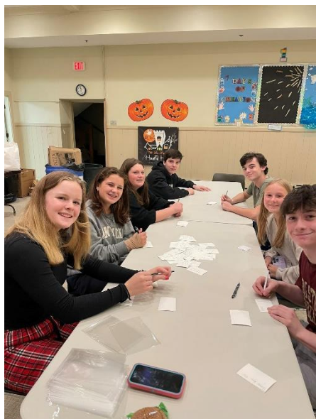
Our High School Youth Group members assembling our Christmas ornament